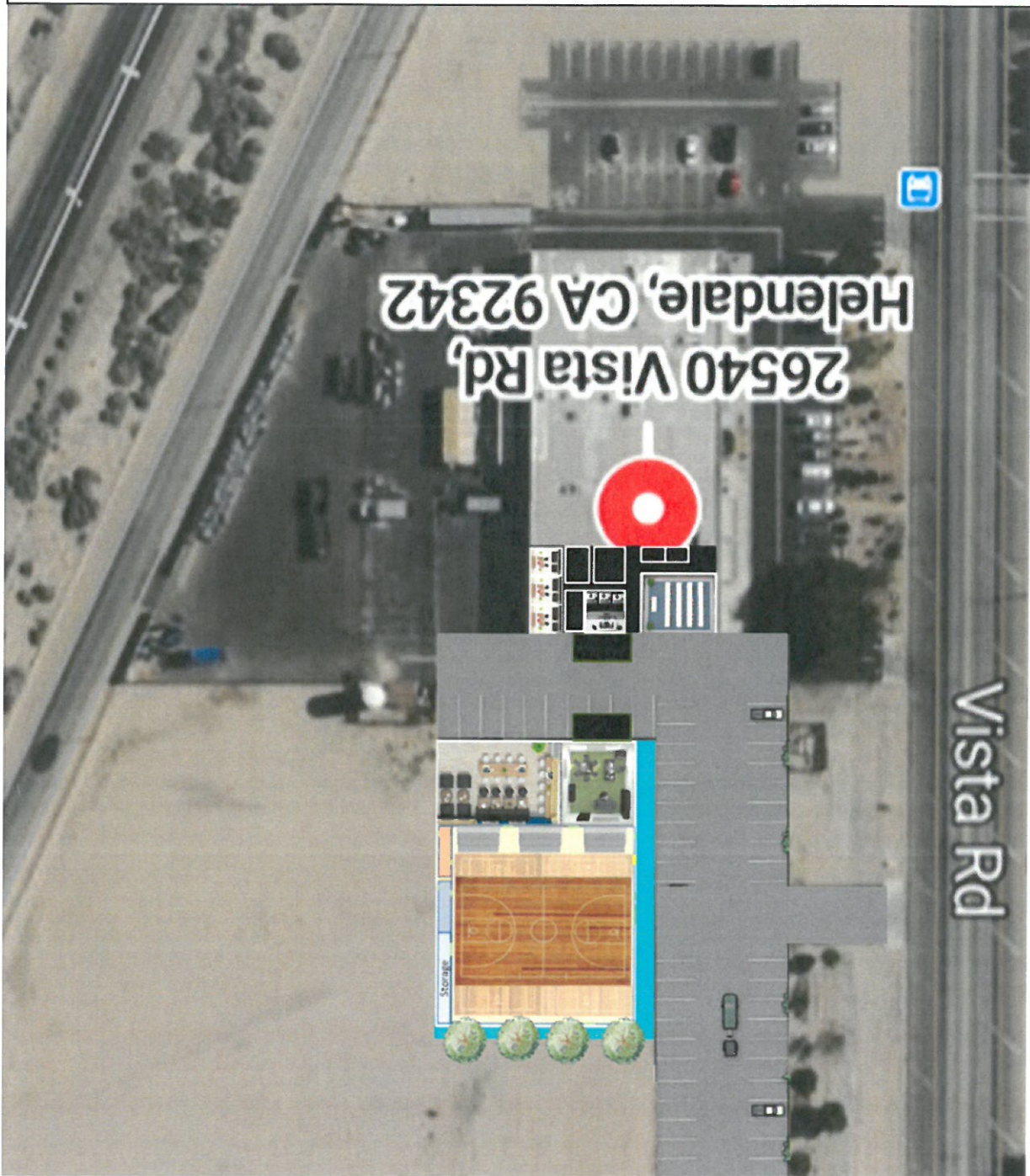
Concept with new office and gymnasium