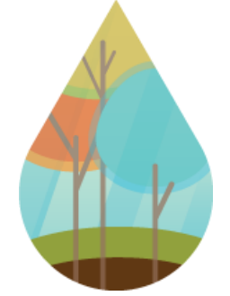
USE MULCH Saves 20–30 gallons per 1000 sq. ft. each time you water.

Saves 12.5 gallons with a water efficient showerhead.